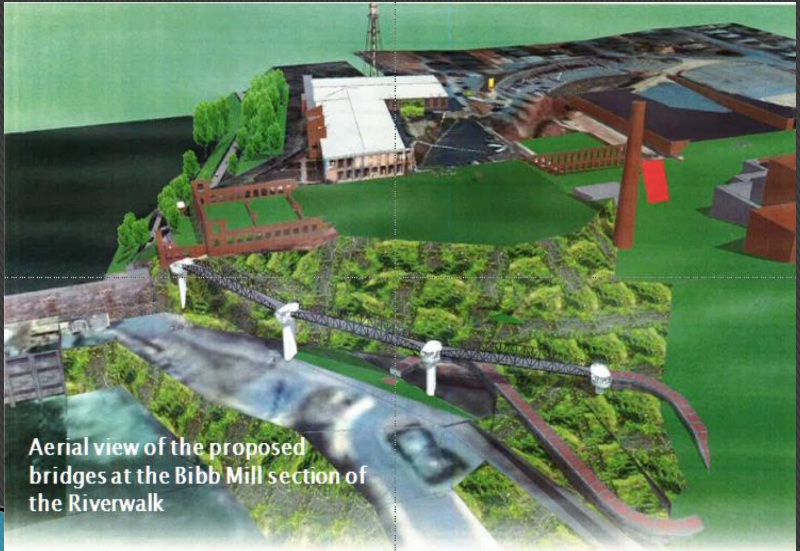
Aerial view of the proposed bridges at the Bibb Mill section of the Riverwalk